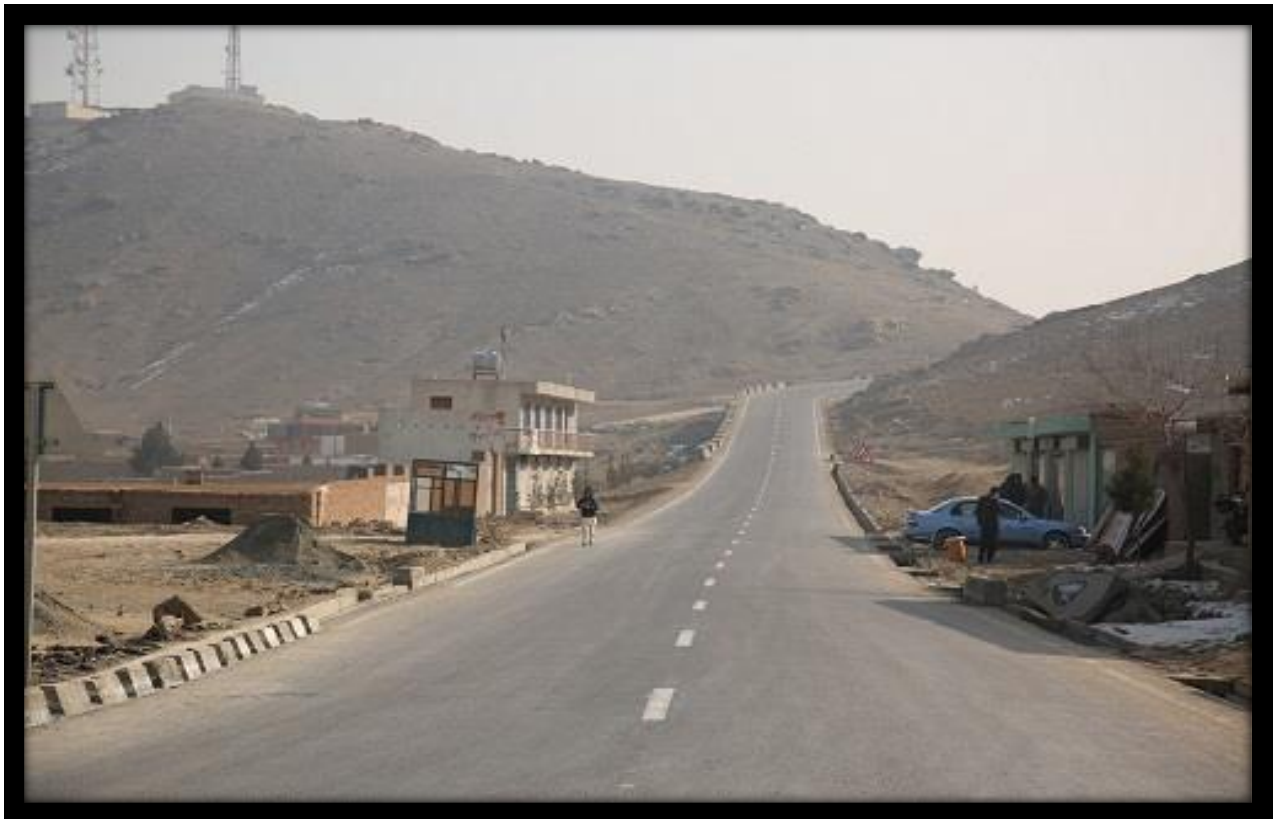
construction of 13.4 km Tangi Tarakheil to Qasaba, Kabul Province (NRAP.MoPW)