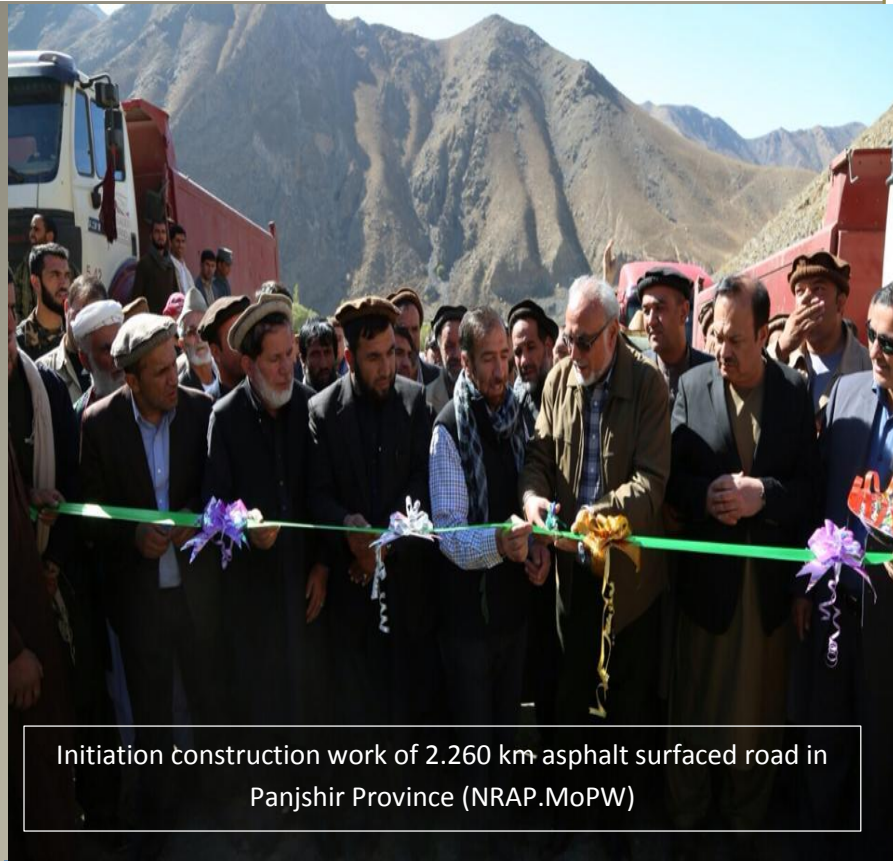
Initiation construction work of 2.260 km asphalt surfaced road in Panjshir Province (NRAP.MoPW)