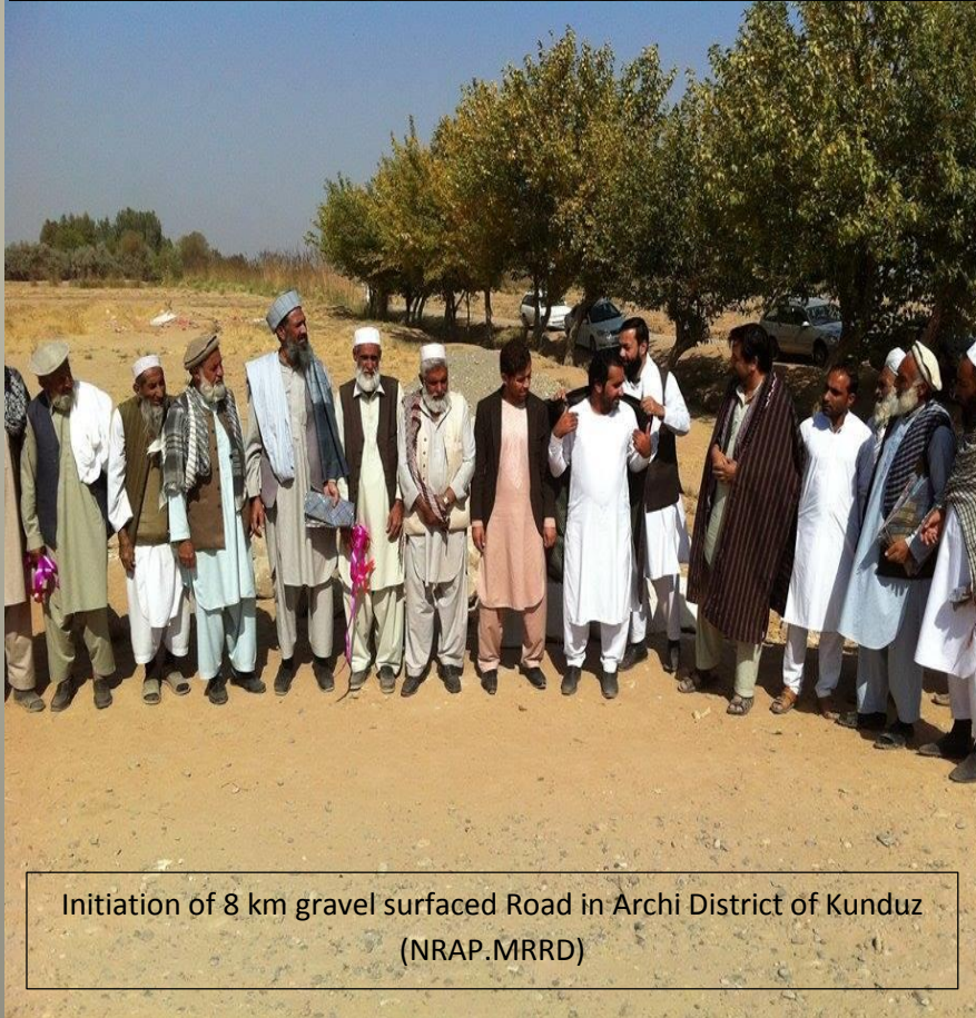
Initiation of 8 km gravel surfaced Road in Archi District of Kunduz (NRAP.MRRD)

Note: NRAP got high capacity to deliver quality and high standard roads while insecurity remains robust threat for implementation.