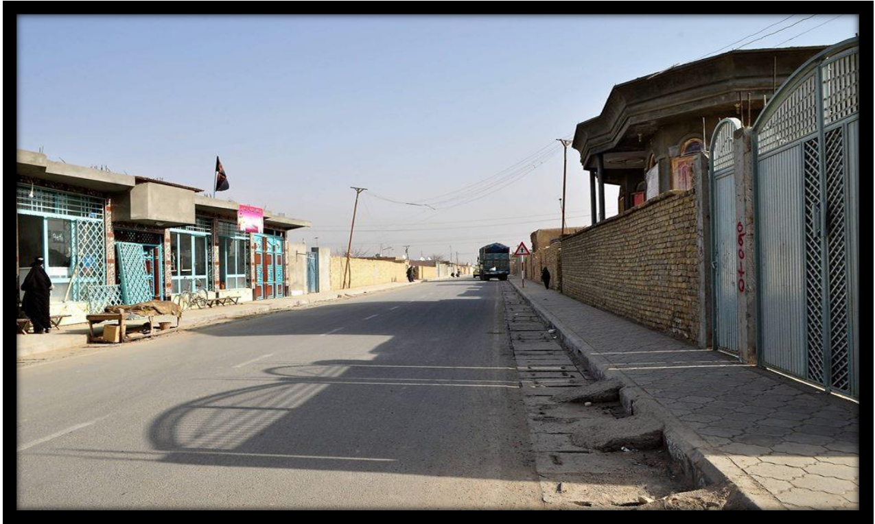
Construction of 1.504 km road in Ali Chopan area of Balkh Province (NRAP.MoPW)