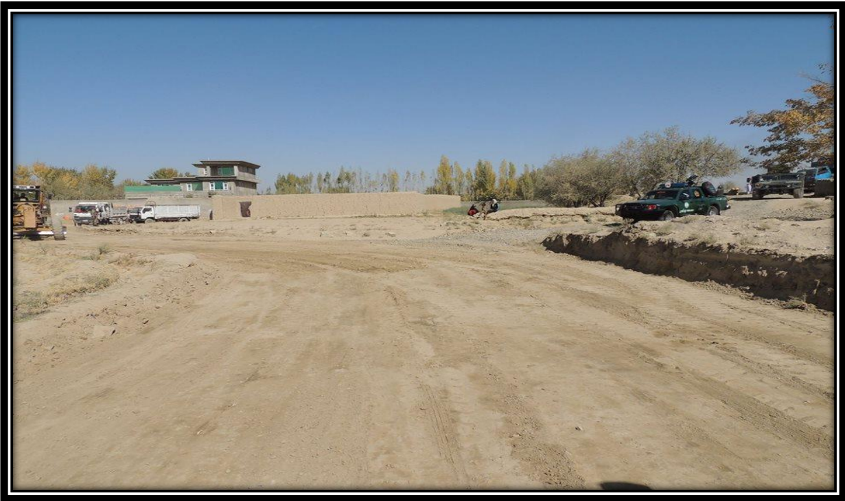
construction works of 11.2 km road from Kabul-Logar (NRAP.MRRD)