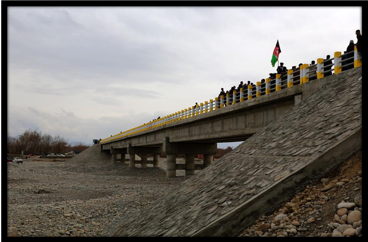
construction work of 140 Rm Bridge, Ese Dowom district of Kapisa Province (NRAP.MRRD)