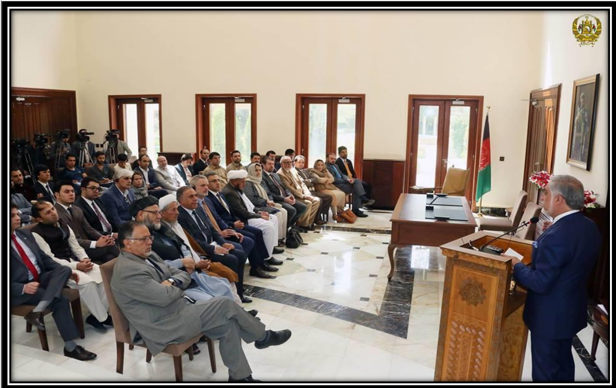
Signing contracts of five construction projects NRAP/MoPW