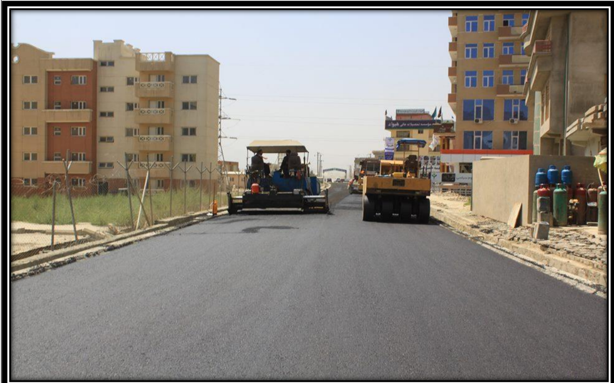
During Construction work of 13.447 Km road Da Sabz District of Kabul Province NRAP/MoPW.