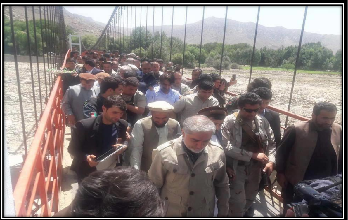
Inauguration of 140 meters Bridge in Kapisa Province NRAP/MRRD