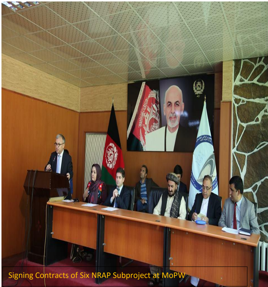
Signing Contracts of Six NRAP Subproject at MoPW