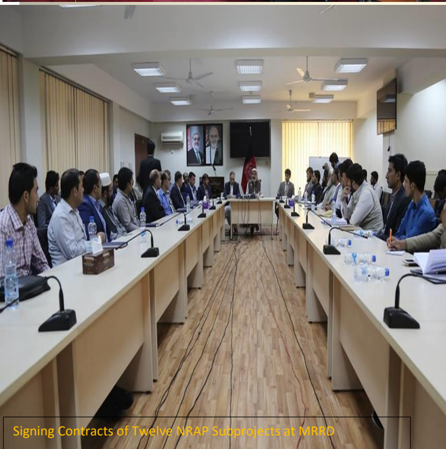
Signing Contracts of Twelve NRAP Subprojects at MRRD