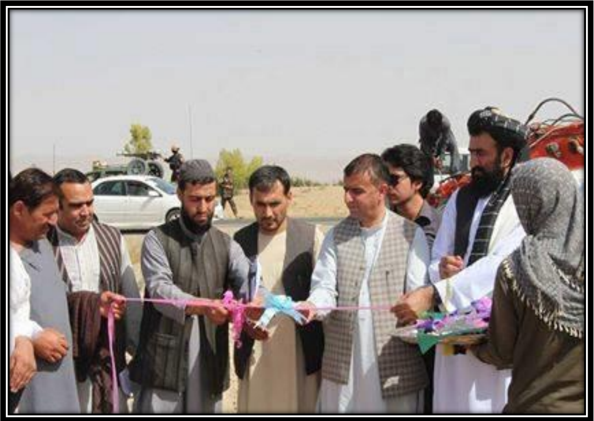
Inauguration of 12.6 Km road in Daman District of Kandahar Province NRAP/MMRD