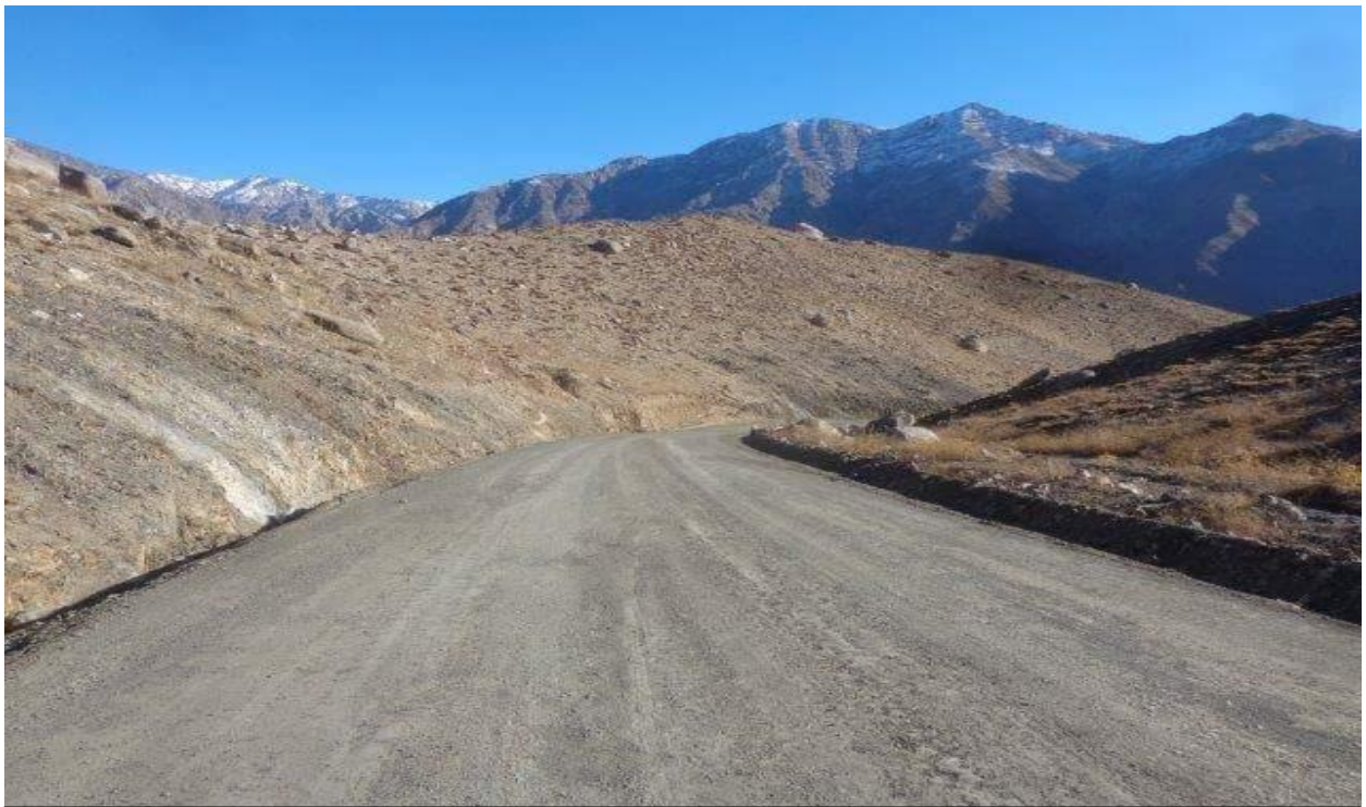
Construction of 10.6 Km road in Rukha district of Panjshir Province.