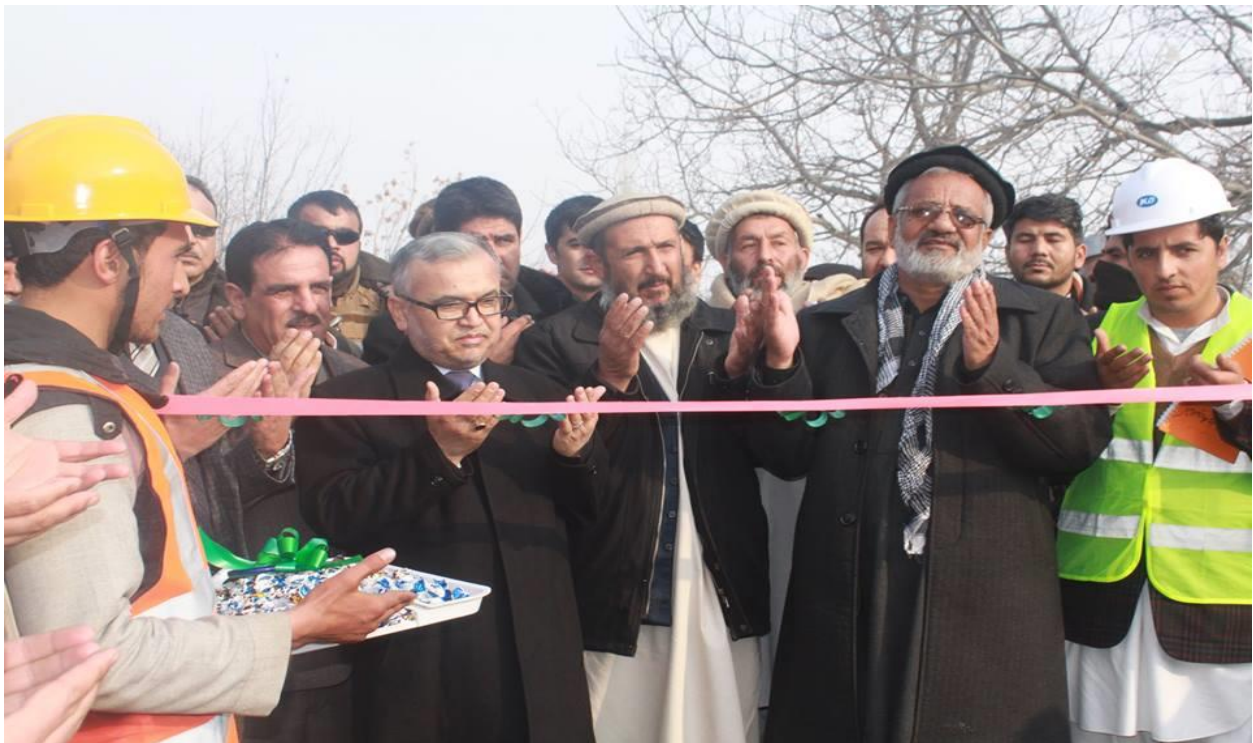
Construction work inauguration of 5.213 KM in Guldara District of Kabul Province.