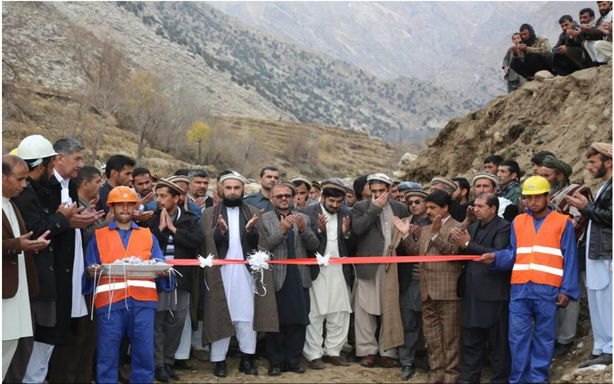
Construction works inauguration of 3 Km gravel surface road along with 30 Rm RCC bridge in Ayar Khil village of Neirab District of Kapisa Province.