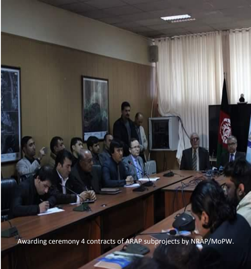
Awarding ceremony 4 contracts of ARAP subprojects by NRAP/MoPW.