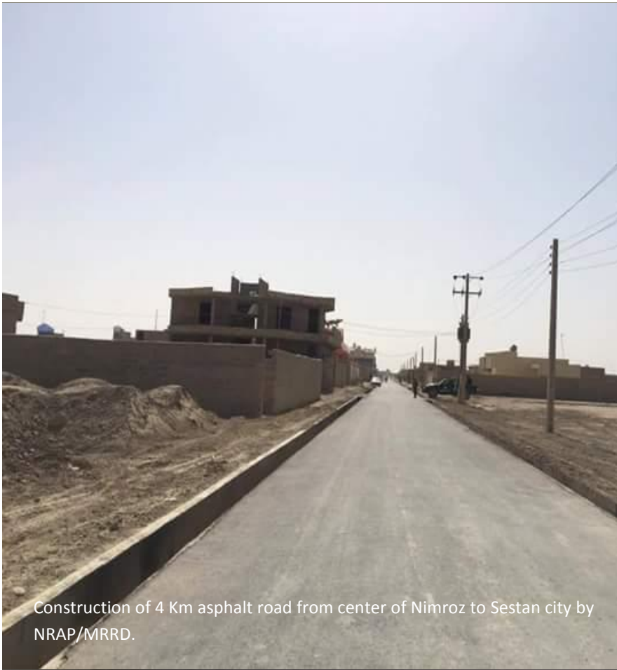
Construction of 4 Km asphalt road from center of Nimroz to Sestan city by NRAP/MRRD.