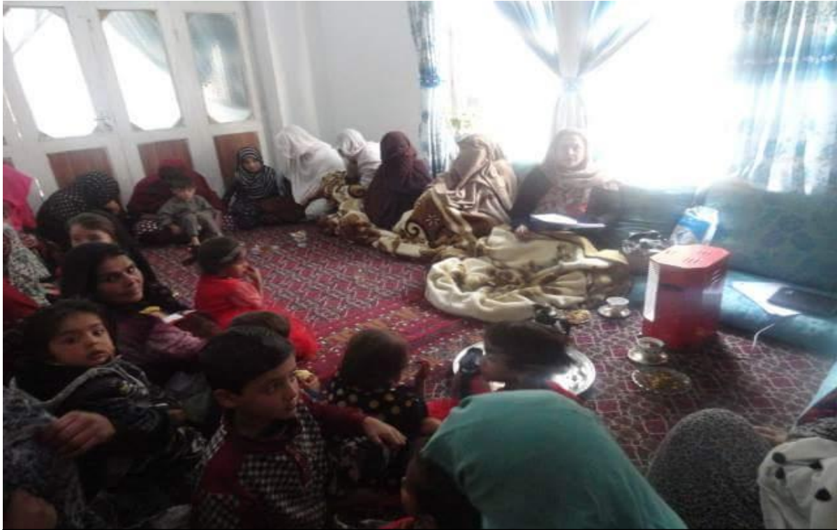
Conducting social survey and beneficiary consultation in Charikar city of Parwan .