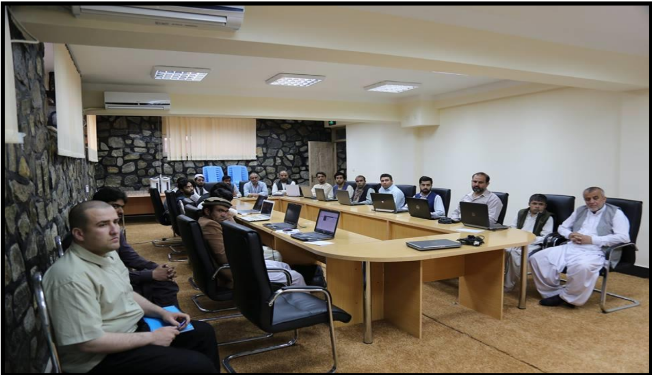
ARAP follow up survey data entry workshop in west region.