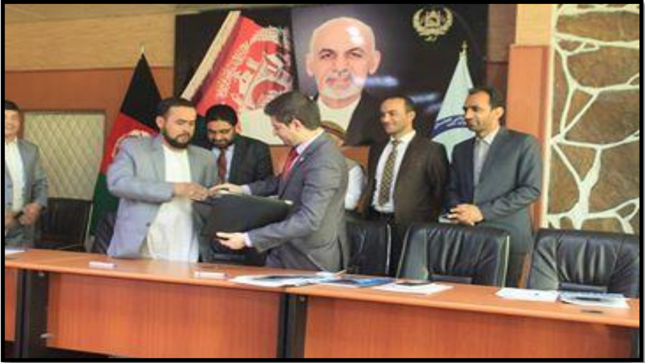
Signing contracts of two construction projects worth 98682058 AFN and 19997617 AFN in Kapisa and Baghlan provinces