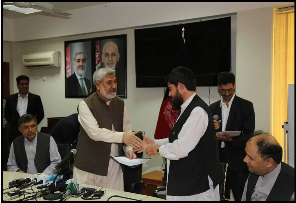
Signing contracts of NRAP worth 428 million AFN