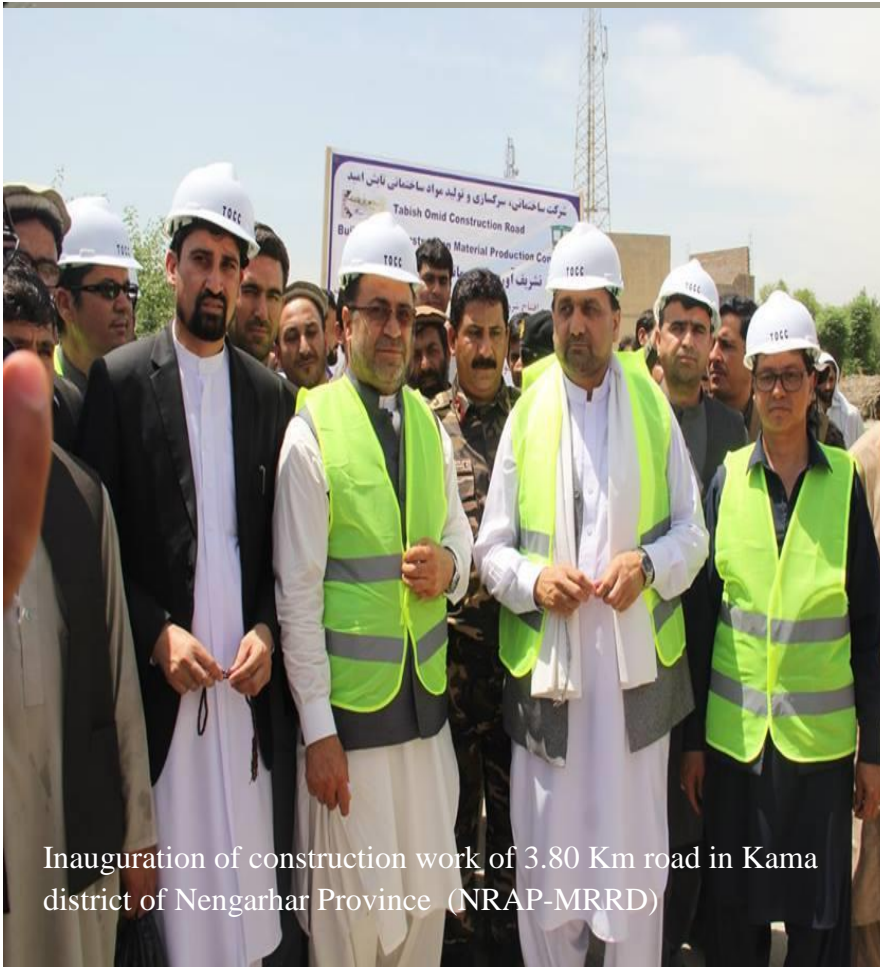
Inauguration of construction work of 3.80 Km road in Kama district of Nengarhar Province (NRAP-MRRD)