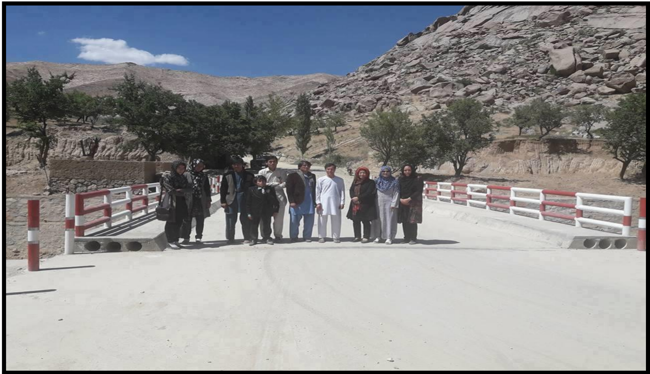
16 Rm Bridge in Nili of Daykundi Province put into utilization of the communities