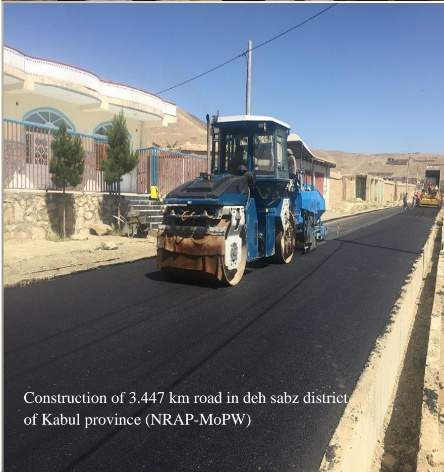
Construction of 3.447 km road in deh sabz district of Kabul province (NRAP-MoPW)

Note: NRAP got high capacity to deliver quality standard roads but security threat is still a problem for on time completion and implementation of the ARAP project.